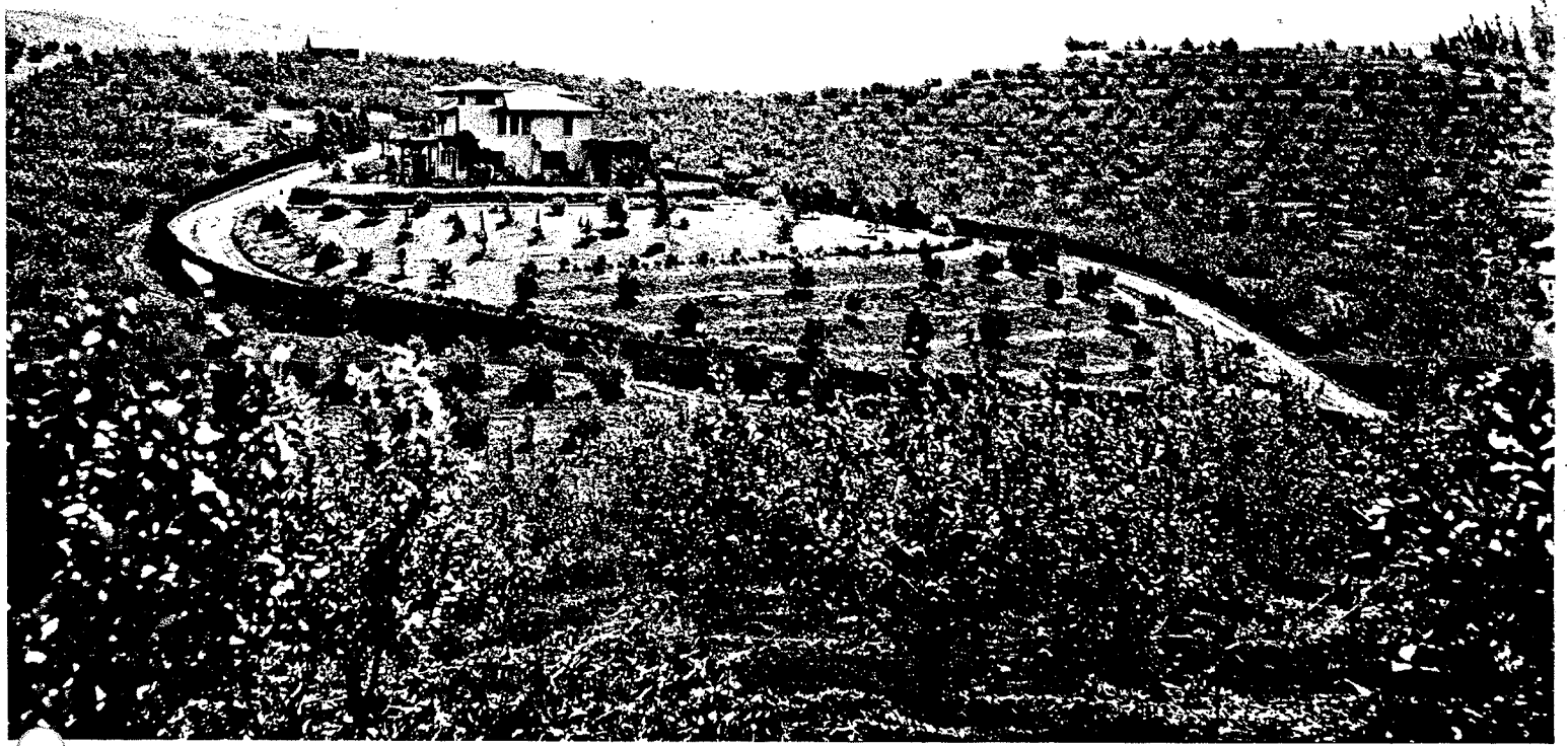
KLEIN RANCH — 1901