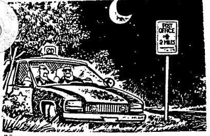
"WE SHOULD BE ABLE TO MAKE THIS MONTH'S SPEEDING TICKET QUOTA WAITING FOR LAST MINUTE INCOME TAX FILERS."

You can waste it or use it for good. What you do today is important because you are exchanging a day of your life for it. When tomorrow comes, this day will be gone forever, leaving in its place something that you have traded for it. You want it to be gain, not loss; good, not evil; success, not failure; in order that you shall not regret the price you paid for it.